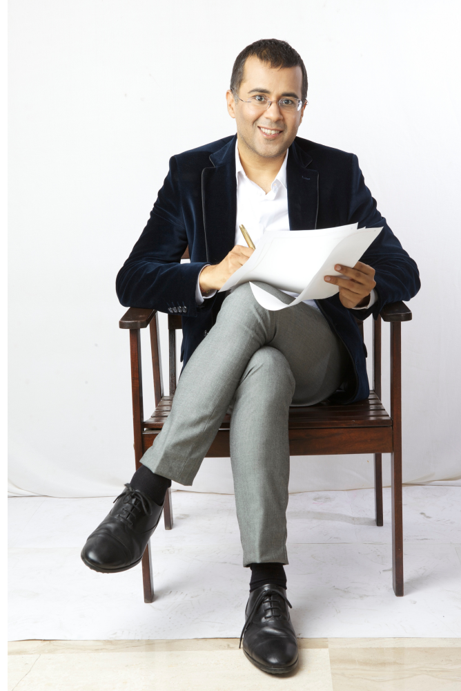
the chetan bhagat motivation series

Motivation often matters more in life than intelligence.